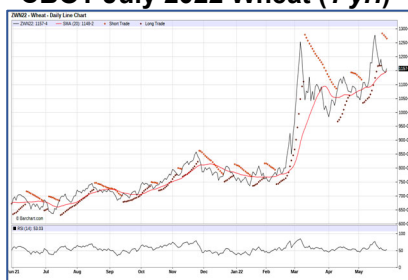
CBOT July 2022 Wheat (1 yr.)