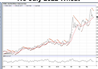
KC July 2022 Wheat